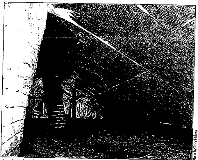
A radiant barrier installed by volunteers. Notice the snug fit between panels to prevent heat from passing through the barrier. This has a good air space between the material and the roof deck.

These first strategies are, conveniently, the most cost effective. Weatherize all openings that pierce a building's envelope. This means weather stripping all windows, repairing doorways, sealing attic stair open-