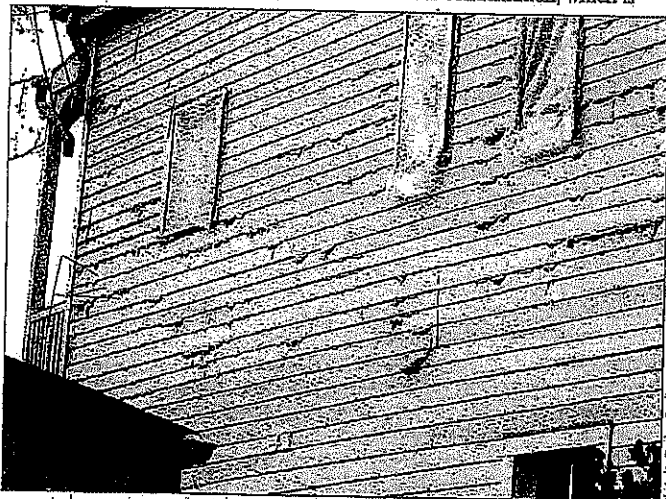
Spray insulation gone wild. This structure has had the tight seal of the siding compromised and now will have to worry about water infiltration.

cool air and is very good at finding ways to do this. The resulting problem is that when warm, wet air hits a cool surface (the back side of your wall) the humidity in the air can be released as condensation, which is